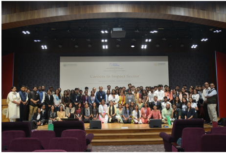
Careers in Impact Sector in Christ University