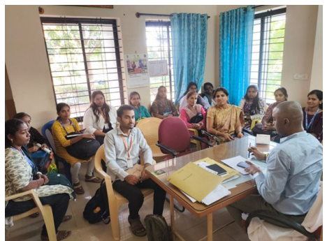
Visit to Office of District Disabled Welfare Chikkaballapura