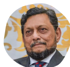
Justice Sharad Arvind Bobde Former Chief Justice of India