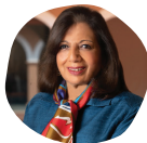
Dr. Kiran Mazumdar-Shaw Executive Chairperson Biocon Limited