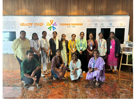
Symposium on Igniting Budding Minds of Social Work Students, Viveka Auditorium, Yuvaka Sangha, Jayanagar, Bengaluru