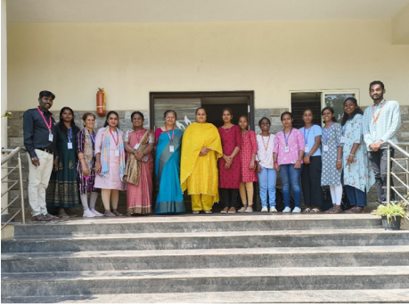
Visit to Sparsha Makkaladhama, Devanahalli