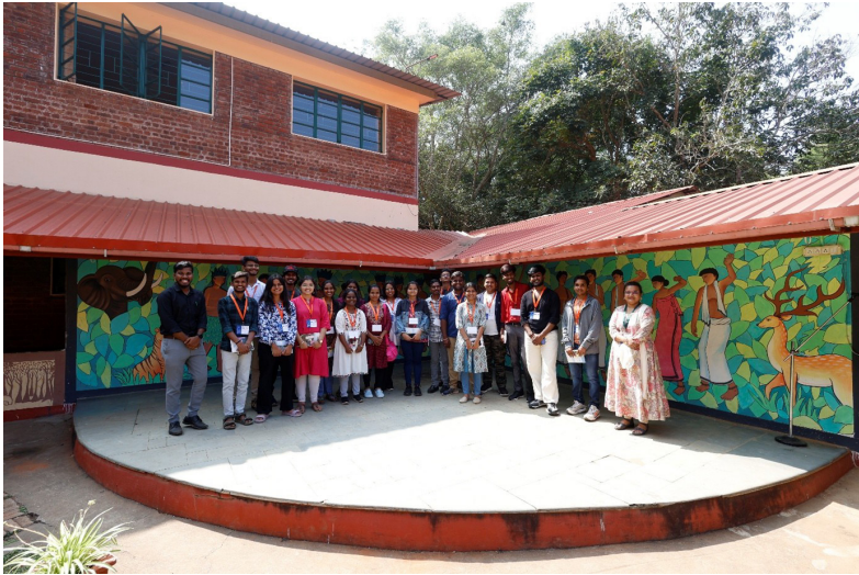
Visit to Viveka Tribal Centre for Learning (VTCL) in Hosahalli, H D Kote taluk