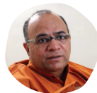
Dr. Chandraprakash Dwivedi Renowned Film Director Member – IGNCA