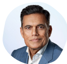
Sri Sajjan Jindal Chairman and Managing Director JSW Group of Companies