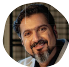
Sri Ricky Kej Indian Music Composer & Environmentalist 3 times Grammy Award Winner