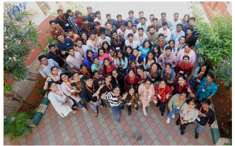
Visit to Vivekananda Institute for Leadership Development and Vivekananda institute of Indian studies, Mysore