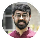
Prof. Manjul Bhargava Professor Princeton University