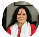
Smt. Sonal Mansingh Renowned Dance Artist Member – Rajya Sabha