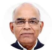
Justice A. V. Chandrashekhara Former Judge High Court of Karnataka