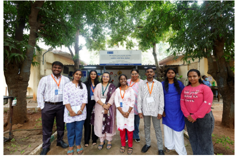
Visit to Palliative Care Center, Swami Vivekananda Youth Movement Mysore