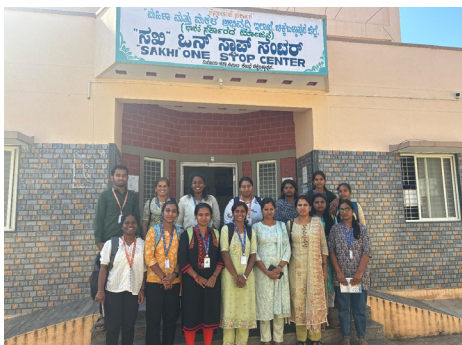
Visit to Sakhi one stop center, Chikkaballapura