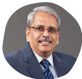
Sri Kris Gopalakrishnan Chairman Axilor Ventures Co-founder Infosys