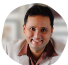
Sri Amish Tripathi Author and Former Diplomat