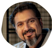
Sri Ricky Kej Indian Music Composer & Environmentalist 3 times Grammy Award Winner