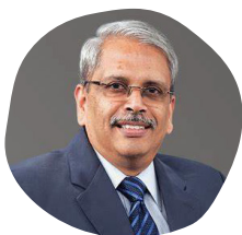
Sri Kris Gopalakrishnan Chairman Axilor Ventures Co-founder Infosys