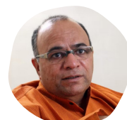
Dr. Chandraprakash Dwivedi Renowned Film Director Member – IGNCA