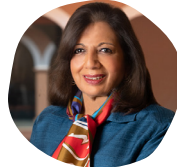
Dr. Kiran Mazumdar-Shaw Executive Chairperson Biocon Limited