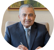
Dr. Sitaram Jindal Chairman and MD Jindal Aluminium Limited