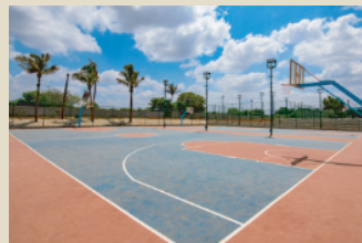
Basket Ball Court