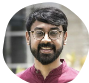
Prof. Manjul Bhargava Professor Princeton University