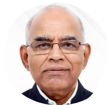
Justice A. V. Chandrashekhara Former Judge High Court of Karnataka