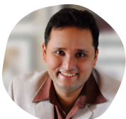
Sri Amish Tripathi Author and Former Diplomat