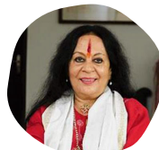
Smt. Sonal Mansingh Renowned Dance Artist Member – Rajya Sabha