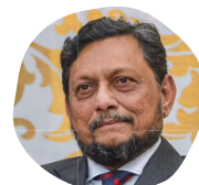
Justice Sharad Arvind Bobde Former Chief Justice of India