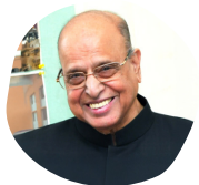
Dr. K. Kasturirangan Former Chairman ISRO