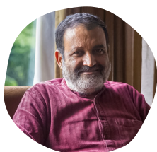
Sri Mohandas Pai Chairman Aarin Capital