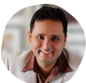
Sri Amish Tripathi Author and Former Diplomat