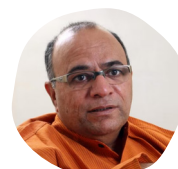
Dr. Chandraprakash Dwivedi Renowned Film Director Member – IGNCA