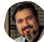
Sri Ricky Kej Indian Music Composer & Environmentalist 3 times Grammy Award Winner