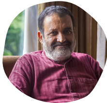
Sri Mohandas Pai Chairman Aarin Capital