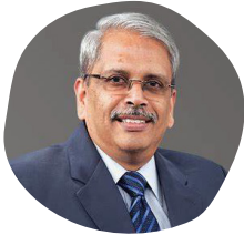
Sri Kris Gopalakrishnan Chairman Axilor Ventures Co-founder Infosys