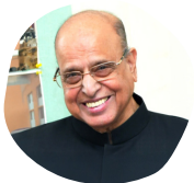
Dr. K. Kasturirangan Former Chairman ISRO