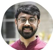
Prof. Manjul Bhargava Professor Princeton University