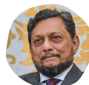
Justice Sharad Arvind Bobde Former Chief Justice of India