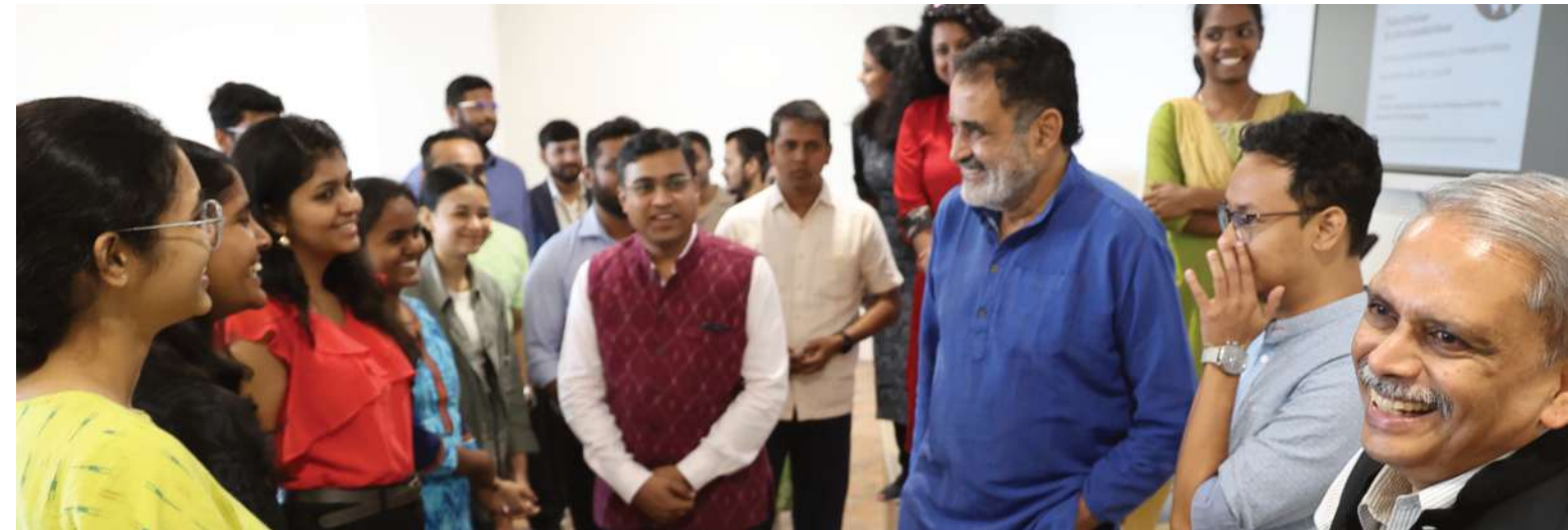
Students engaged in enriching interactions