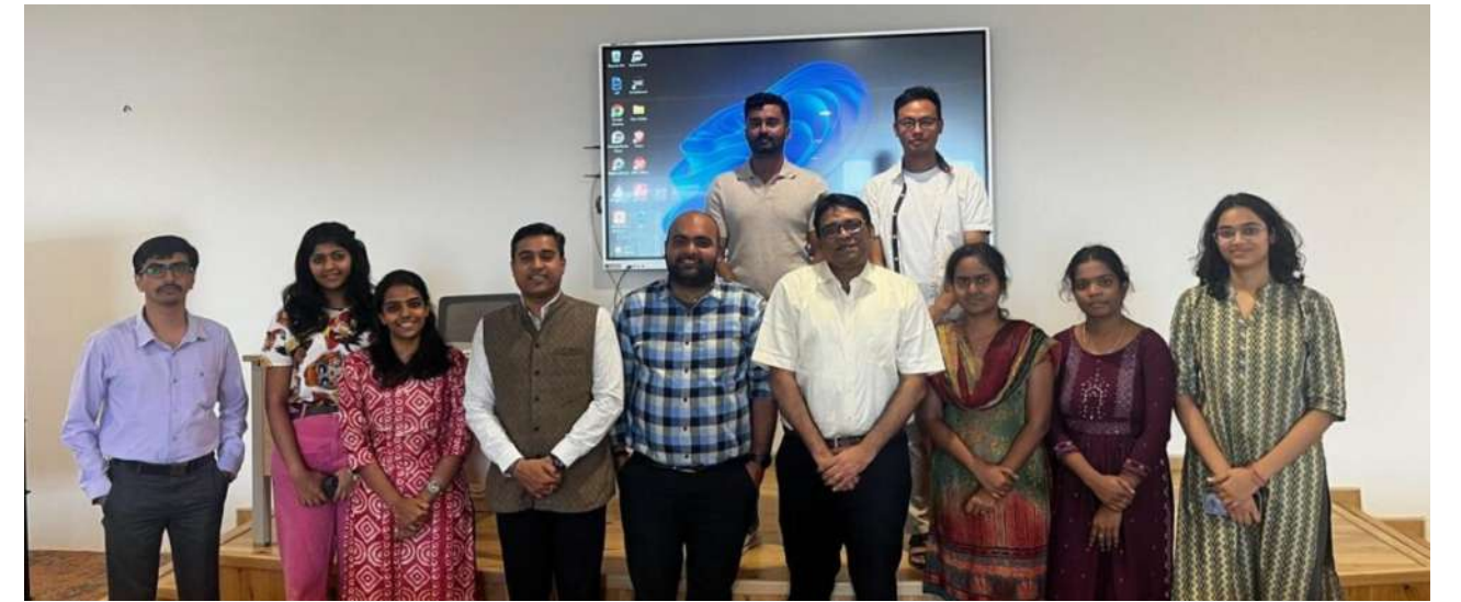
Team from Janaagraha with fellows and faculty

Professor of political science at Tennessee Technological University, Tennessee and Secretary-General, EU Turkey Civic Commission (EUTCC)