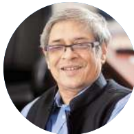
Padma Shri Dr. Bibek Debroy

Chairperson, Economic Advisory Council to the Prime Minister, Government of India.