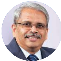
Padma Bhushan Shri Kris Gopalakrishnan

Former Director, Indian Council of Agricultural Research (ICAR) and Chancellor, Central Agricultural University, Imphal and Chairman of the Karnataka Science and Technology Academy (KSTA).