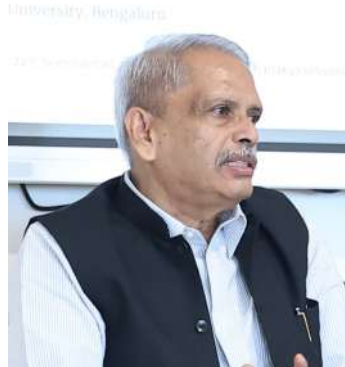
Kris Gopalakrishnan Co-Founder & Ex-CEO, Infosys Chairman, Axilor ventures