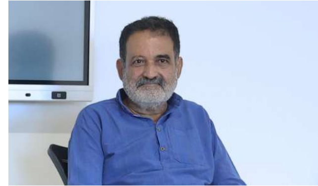
Sri Mohandas Pai Chairman, Manipal Global Education Services