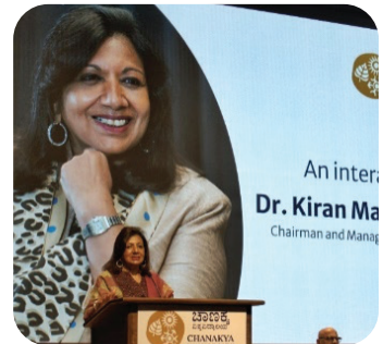
Dr. Kiran Mazumdar-Shaw, Executive Chairperson, Biocon Ltd