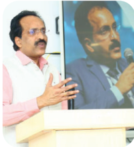
Sri. S Somanath, Chairman-ISRO