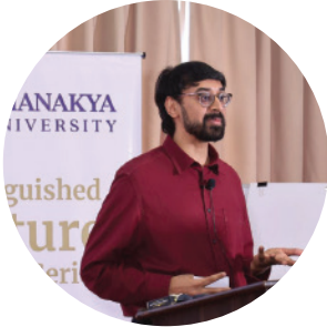
Prof. Manjul Bhargava delivering his keynote on The World of Mathematics, Music and Magic.