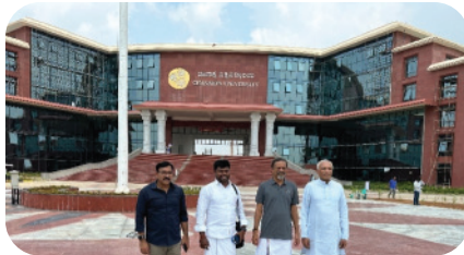
Sri Sridhar Vembu, Founder and CEO-Zoho Corporation