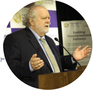
Prof. Walter Russel Mead delivered the keynote address on the "GLOBAL POLITICAL TRANSITION: IS THE US READY?"