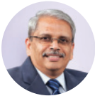
Sri Kris Gopalakrishnan Co-founder & Ex CEO, Infosys, Chairman, Axilor Ventures