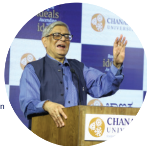
Prof. Bibek Debroy delivered the keynote address on the "Key transitions in the Indian Economy"