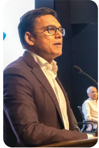
Sri. Sajjan Jindal, Chairman-JSW Group