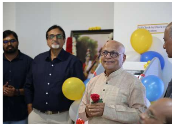
21 st October, 2024 | Unveiling of Automated Library System